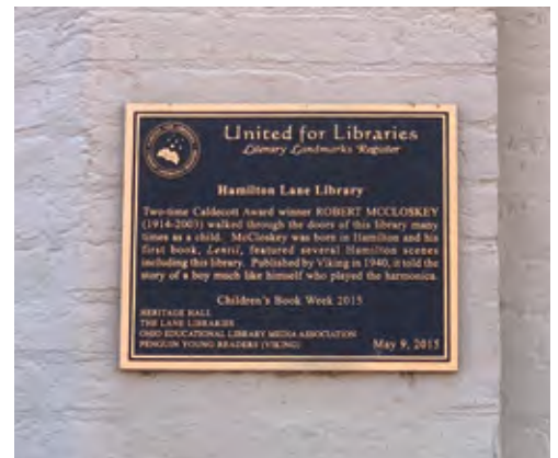
Literary Library Plaque

While you are at the Lane Public Library, check out the plaque on the front of the library honoring Hamilton hometown boy, Robert McCloskey. Two-Time Caldecott Award winner Robert McCloskey (1914-2003) walked through the doors of this library many times as a child. McCloskey was born in Hamilton and his first book, Lentil , featured several Hamilton scenes including this library. Published by Viking in 1940, it told the story of a boy much like himself who played a harmonica (you can see a sculpture featuring Lentil across from the Butler County Courthouse). This plaque in honor of United for Libraries Children's Book Week was dedicated by the library as a literary landmark in 2015.